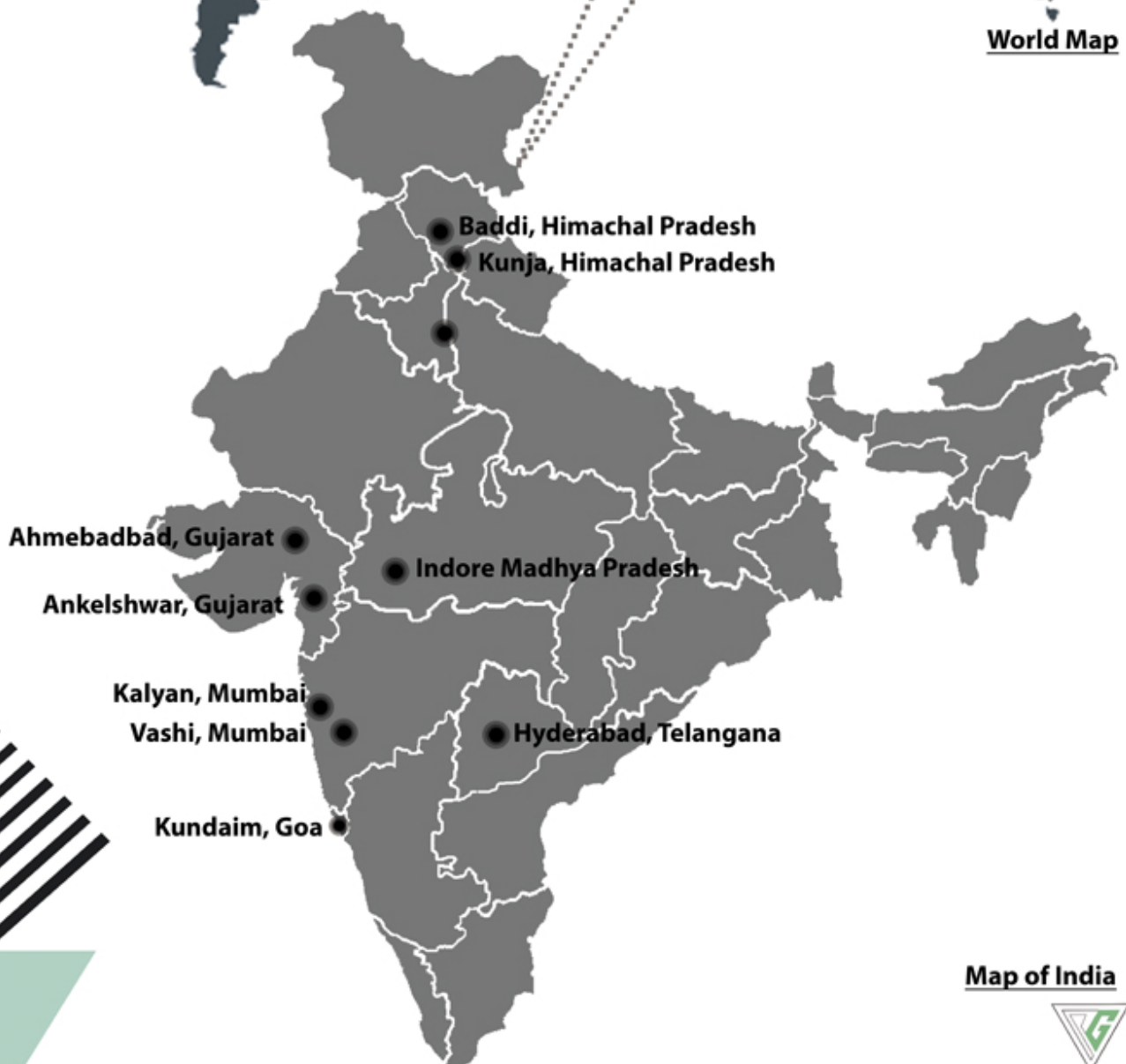
Map of India